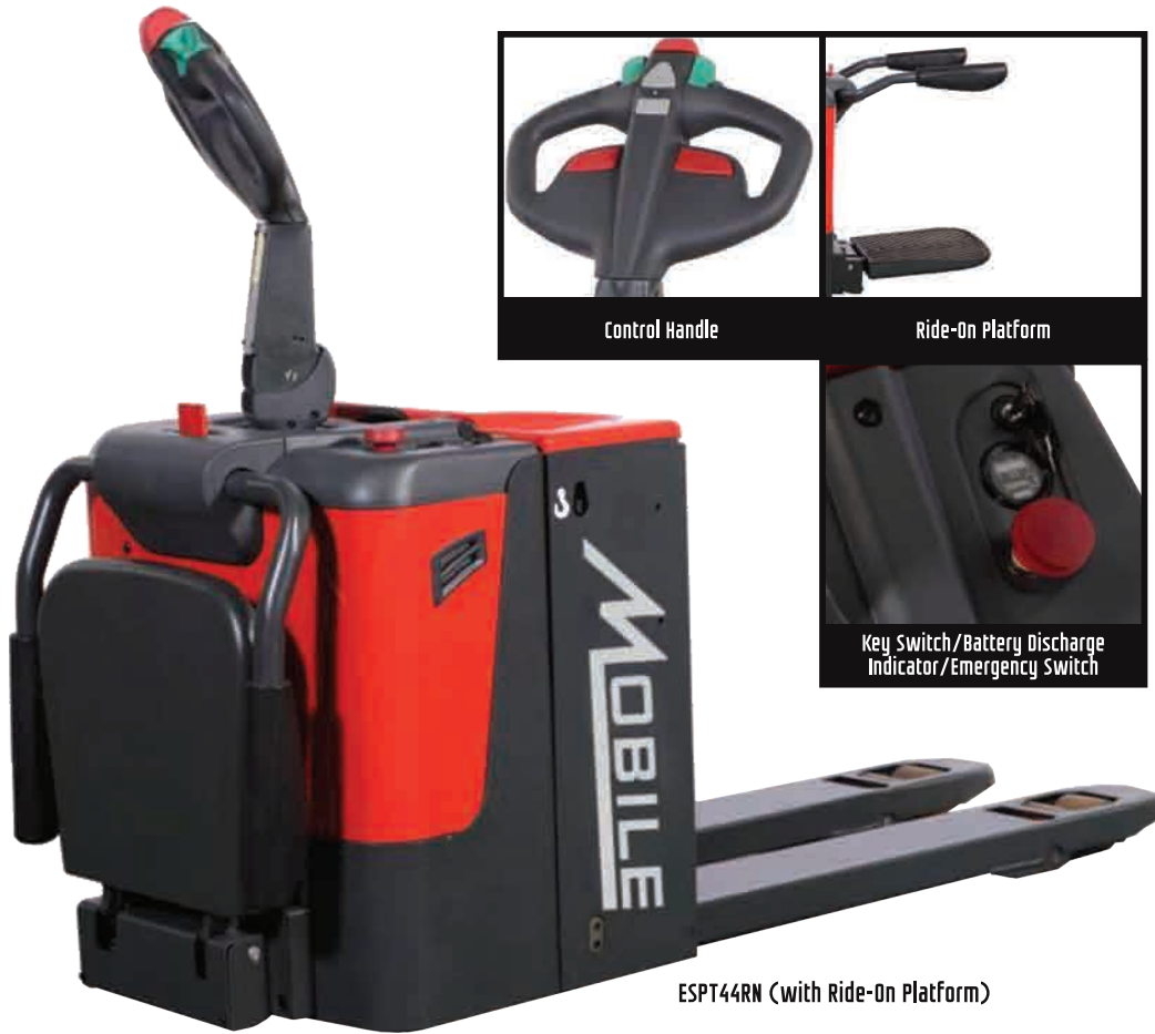
ESPT44RN (with Ride-On Platform)